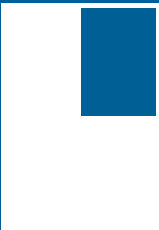
QUARTER PAGE 93x62mm